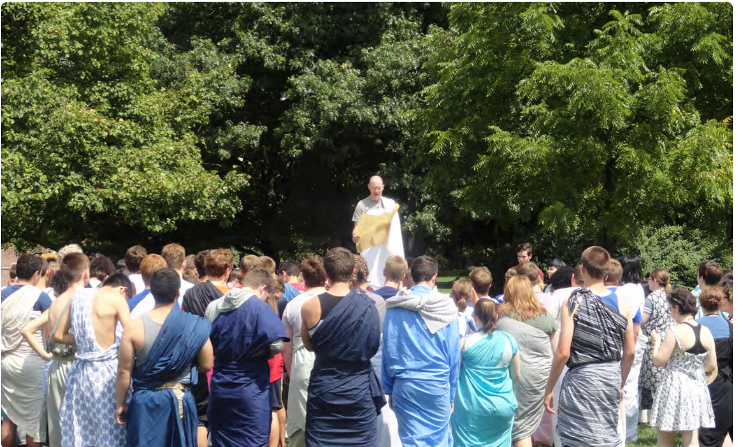
Students participate in a Greek-themed “public trial” of Plato.