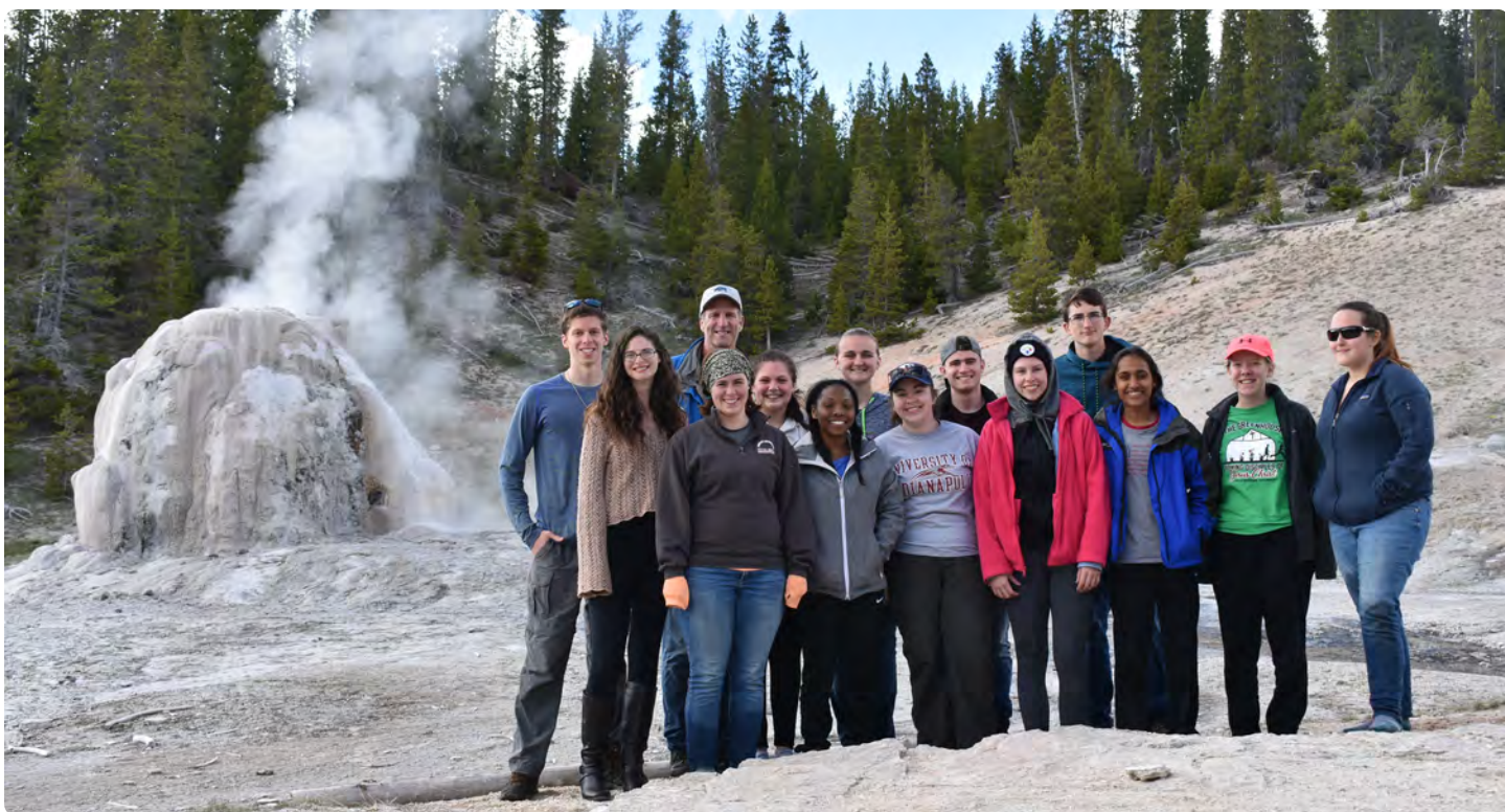
Academy students traveled to Yellowstone National Park in Wyoming during a 2018 May Term.

Free peer-tutoring services are available to help students who may find a particular class especially challenging. This is an organized program where peers approved by teachers can tutor other Academy students. To meet with a tutor, students must simply submit a request.