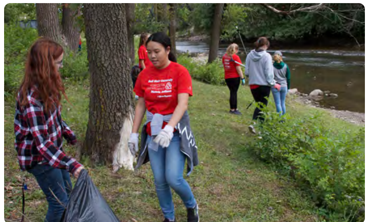
Students volunteer during the United Way “Day of Action”