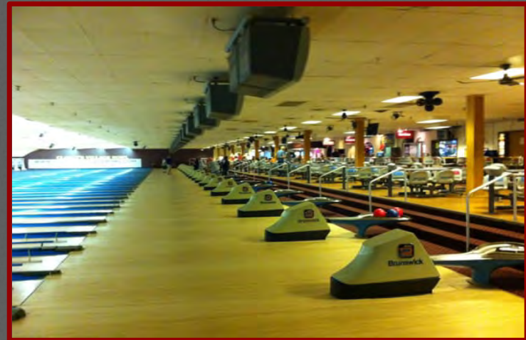
CLANCY'S VILLAGE BOWL