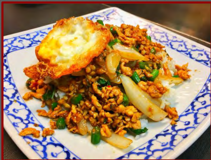
THAI SMILE 2